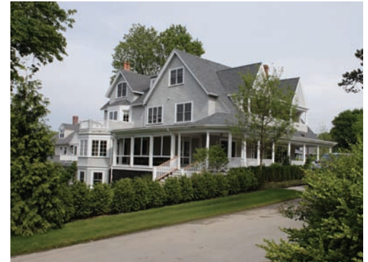
A turn-of-the-century home in Hingham, MA, is getting a plumbing and heating face lift.